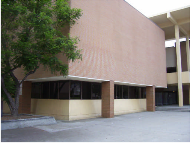
Figure 1: Photo of Building